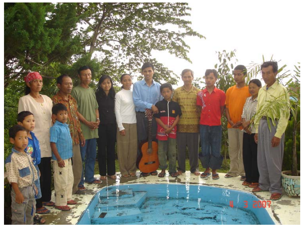
Believers from Muslim background getting ready for water baptism

Since its inception, the vision of YMTC and SOM has been to provide, with the Lord's help, a Biblical base for practical ministry training or a school of ministry "without walls." We have helped and trained believers, young and old, to serve as church planters, church workers or missionaries to fulfill the Great Commission. Our aim, by God's grace, is to serve the body of Christ in Indonesia in particular. And it is all because of God's grace and mercy and the faithful prayers of His people like you